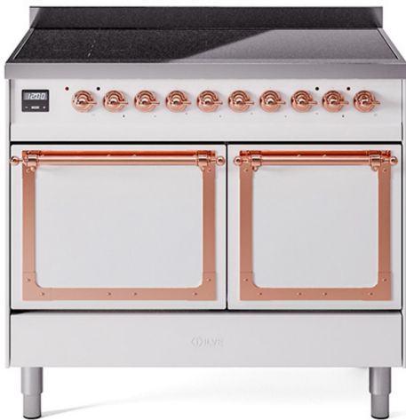
Solid Door | Nobless Frame