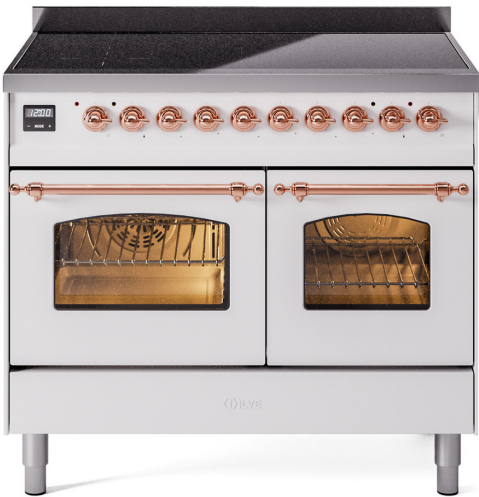
Glass Door | No Frame