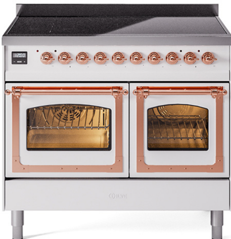
Glass Door | Nobless Frame