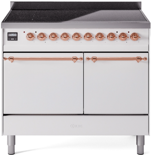
Solid Door | No Frame